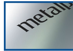
GLOSS highly reflective, mirror-like