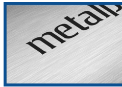
# 4 brushed to resemble a stainless steel finish