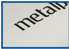
MATTE non-reflective with dull finish