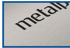
SATIN semi-gloss medium reflective material