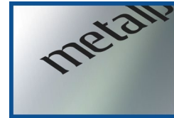
GLOSS highly reflective, mirror-like