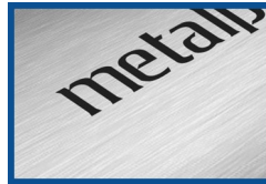
# 4 brushed to resemble a stainless steel finish