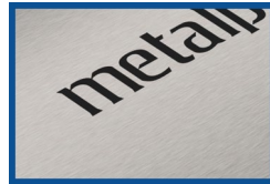
SATIN semi-gloss medium reflective material