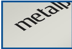
MATTE non-reflective with dull finish