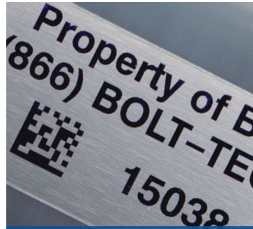
UDI Barcode Asset Identification