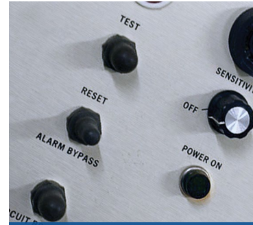
Medical Device Control Panels