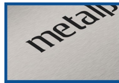
SATIN semi-gloss medium reflective material